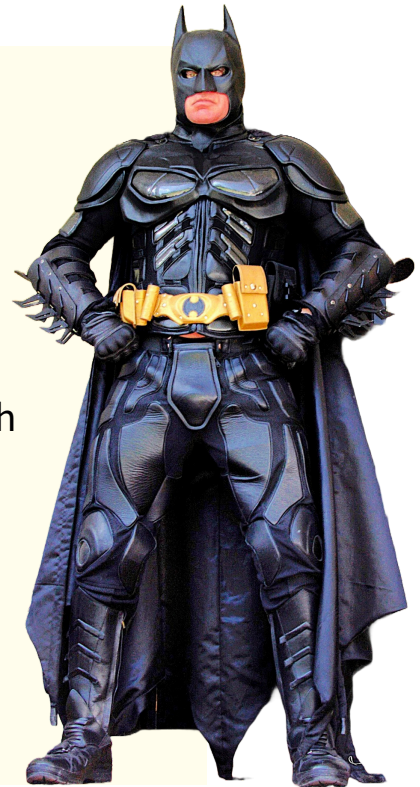
Okanagan Batman Captured by Sue Cseh - Bat Festival 2024

The fall colours are always breathtaking so plan a visit and bring your camera to capture!